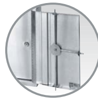
Triple Bolt Lock

Cabinet top reverses for left or right hinge door mounting.