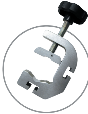
Omni Clamp #741325