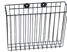
Transport Basket #350002