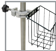
Basket Adapter #741332