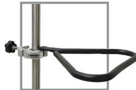
Transport Handle #741327