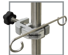
Stat Hanger #741331